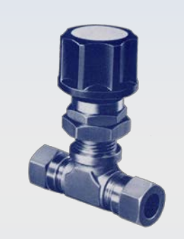
511 4mm bore, 1/4in unions